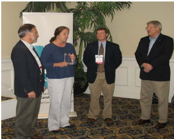
Award of Merit, Large Jurisdiction – Awarded to the City of Greenville for “Plan-it Greenville”, the City of Greenville 2009 Comprehensive Plan.