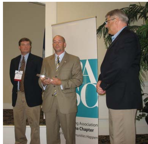
Outstanding Planning Project, Innovative Use of Technology – Awarded to the City of Sumter for its 2010 Abandoned Housing Survey utilizing Geographic Information System (GIS) and Global Positioning System (GPS) technologies.