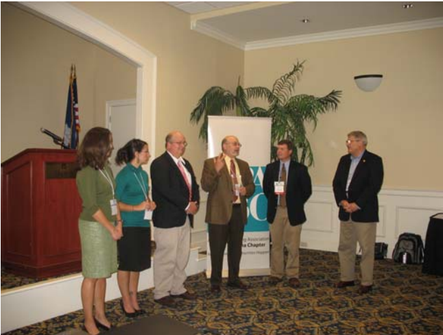
Outstanding Planning Project, Large Jurisdiction – Awarded to Charleston County for the Charleston County Comprehensive Plan Update: “Guiding the Future for a Lasting Lowcountry.”

The South Carolina Chapter of the American Planning Association (SCAPA), a nonprofit education and membership organization dedicated to advancing the art, science, and profession of community planning across the state, recently presented its 2010 planning awards. Six planning project awards were made to South Carolina communities and organizations. Award selection criteria include quality of the product, innovation in approach or process, transferability to other jurisdictions in South Carolina, significance to the community, implementation potential and sustainability over time. Two additional awards, Distinguished Planner and Planning Advocate, recognized individual planning excellence in South Carolina.