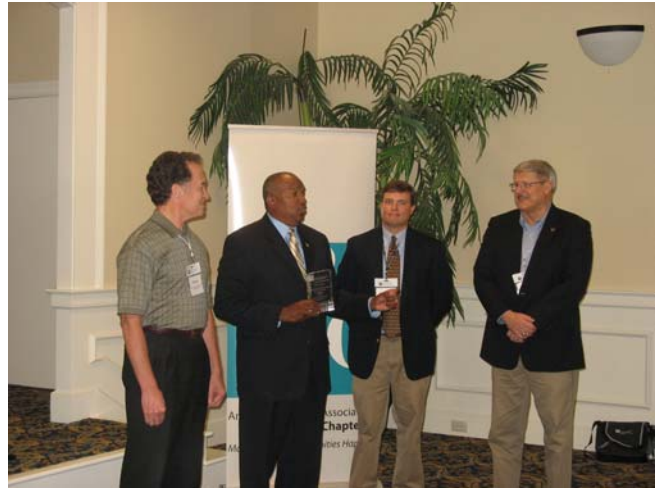
Outstanding Planning Project, Small Jurisdiction – Awarded to the Town of Blythewood for the Town of Blythewood Master Plan.